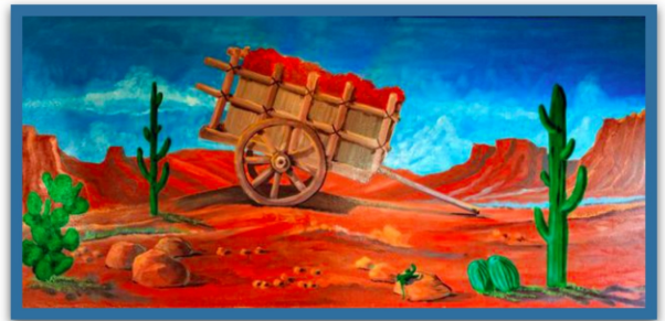
LIVE MARIACHI MUSIC FRIDAYS AND SATURADAYS

Sunday-Thursday 11am -12am Friday-Saturday 11am - 2am